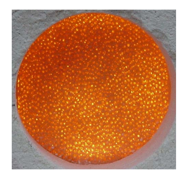
Figure 3 Oil flame inside of a ceramic radiant burner at BNL